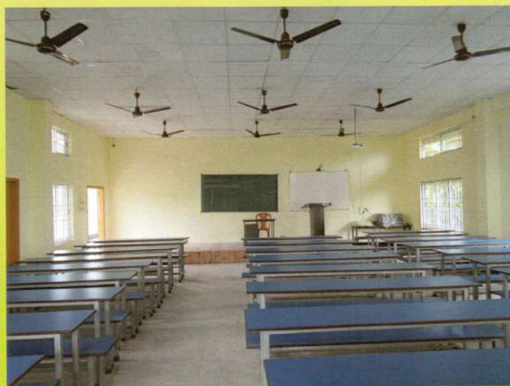
A Newly constructed classroom cum seminar hall