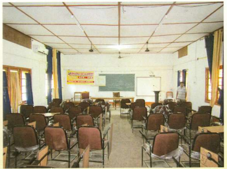
A View of Seminar Hall