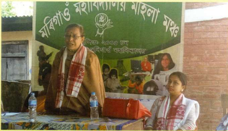
Extention activity by Mahila Mancha at Doloichuba Village