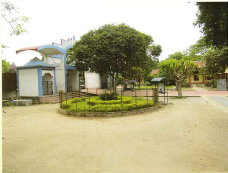
A view of the College