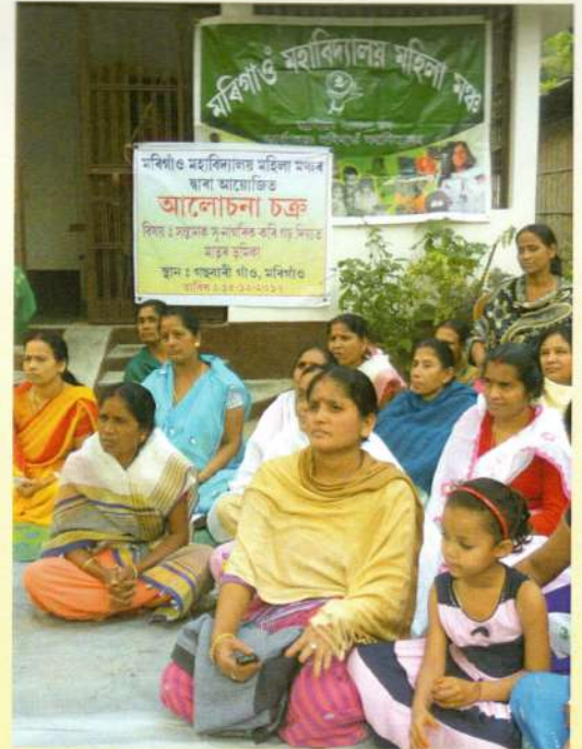
Extention activity by Mahila Mancha at Gasbari Village