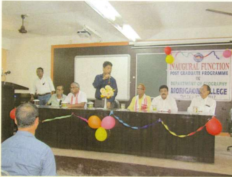
Inaugural Programme of Masters' Degree in Geography