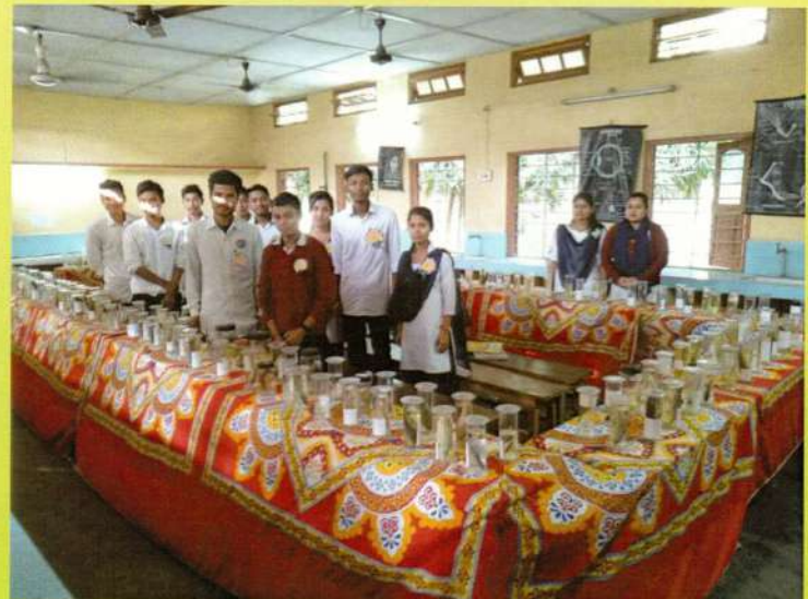
Celebration of Science Day at College