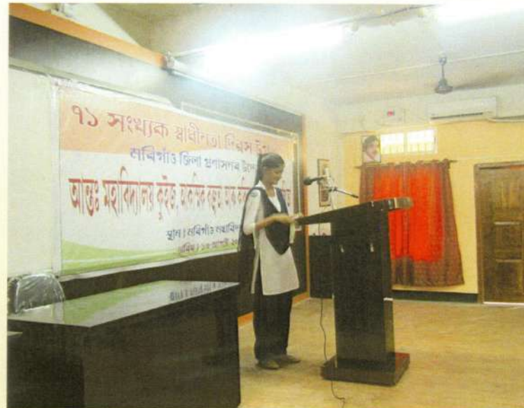
A student participating in extempore speech competition organised by the District Administration in the College