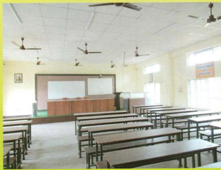
Hall - 1