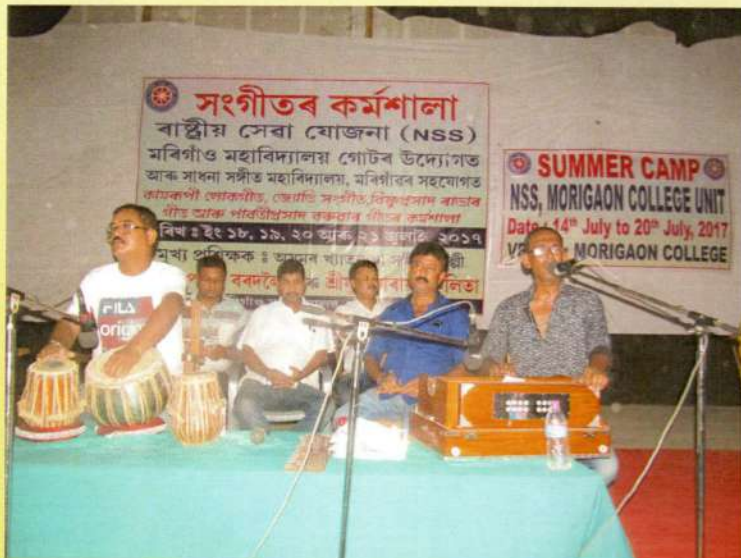
Summer camp at Morigaon College