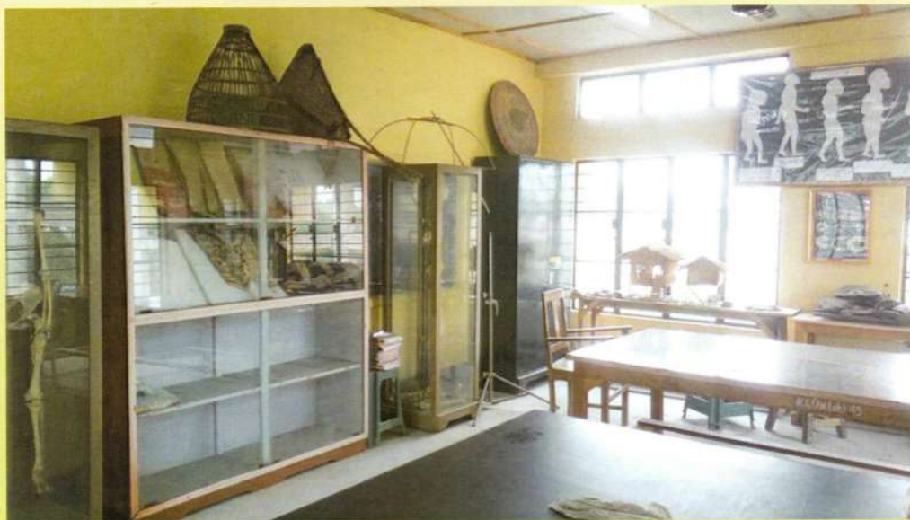
Museum, Dept. of Anthropology