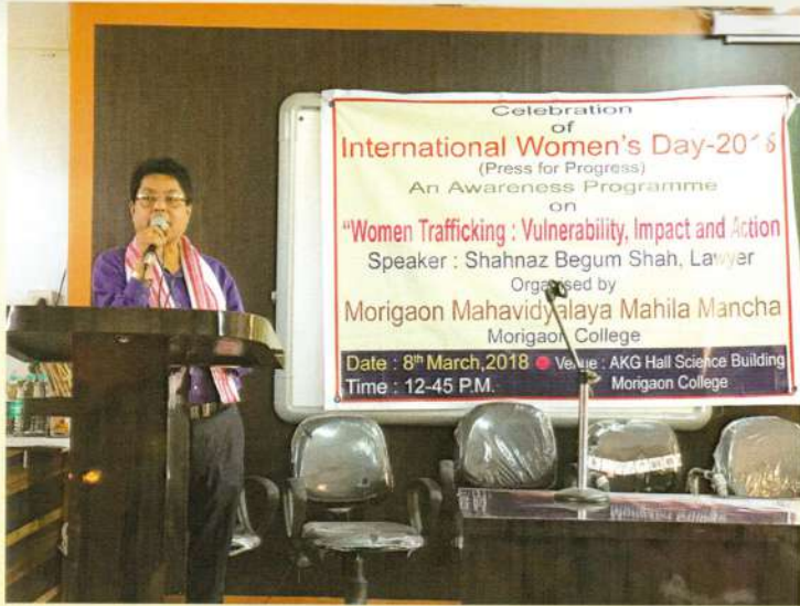
Celebration of International Women's Day