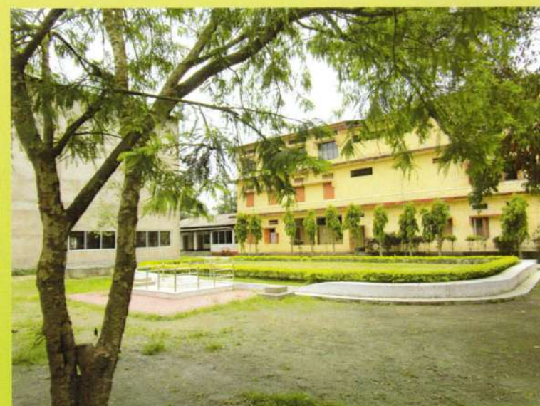
A view of the Campus