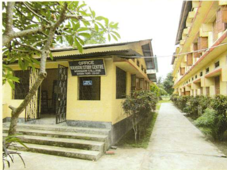
KKHSOU Study Centre