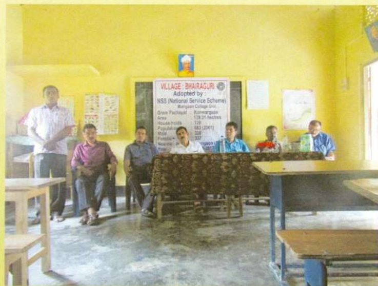
Village adoption programme