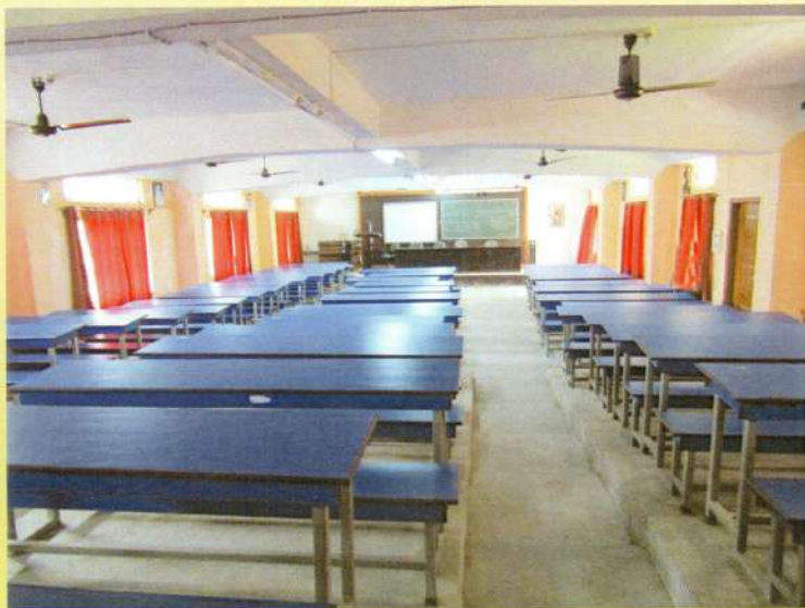
Akhil Kumar Gohain Memorial Conference Hall