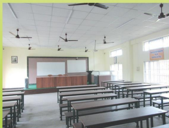
Hall - 1