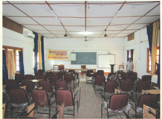
A View of Seminar Hall