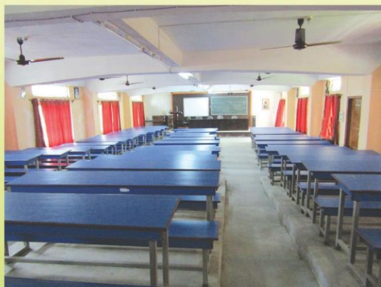
Akhil Kumar Gohain Memorial Conference Hall