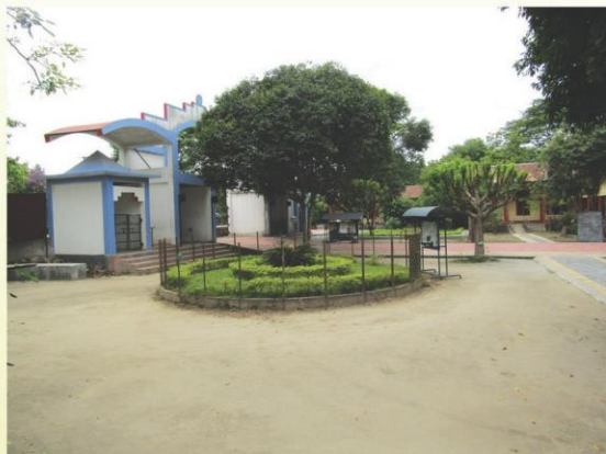
A view of the College