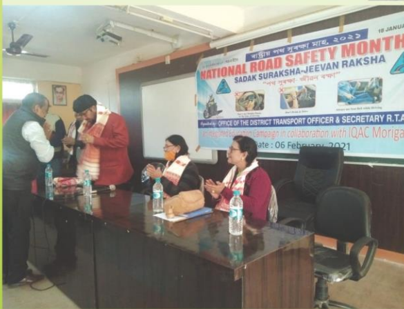
National Road Safety Month Extension Activity Collaborated by IQAC, Morigaon College