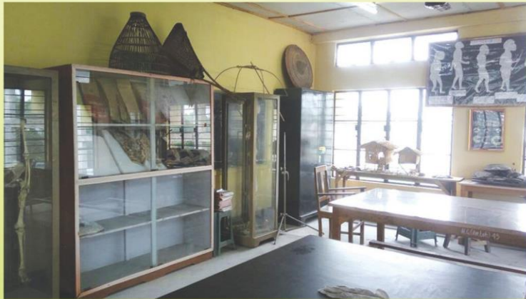
Museum, Dept. of Anthropology