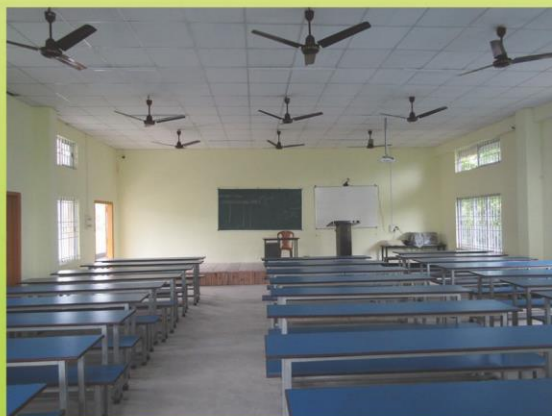
A Newly constructed classroom cum seminar hall