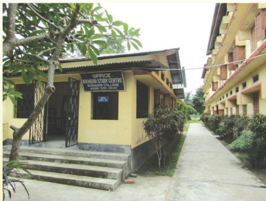
KKHSOU Study Centre