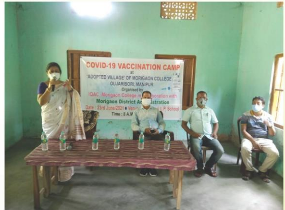
Covid-19 Vaccination Camp Extension Activity Organised by IQAC, Morigaon College