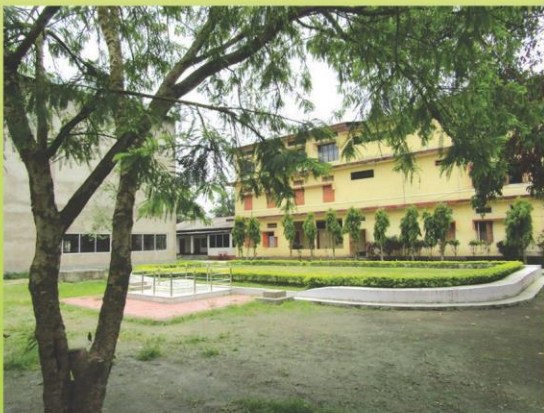
A view of the Campus