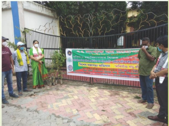
Special Awareness Programme Extension Activity Organised by Morigaon College Teachers' Unit at Morigaon Gosgaon