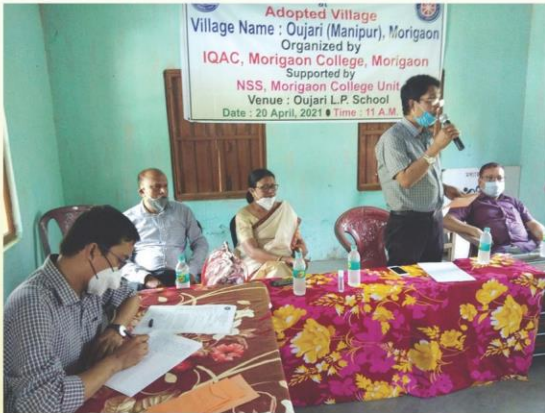
Adopted Village, Oujari (Manipur) Extension Activity Organised by IQAC, Morigaon College