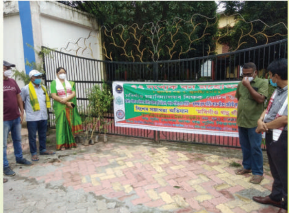
Special Awareness Programme Extension Activity Organised by Morigaon College Teachers' Unit at Morigaon Gosgaon