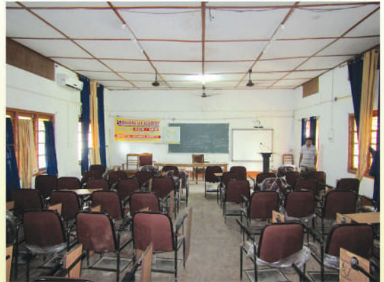
A View of Seminar Hall