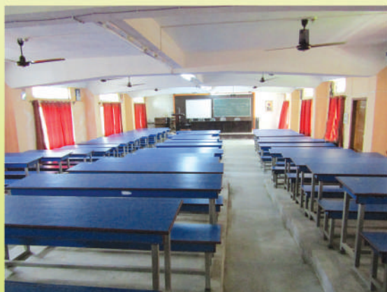
Akhil Kumar Gohain Memorial Conference Hall