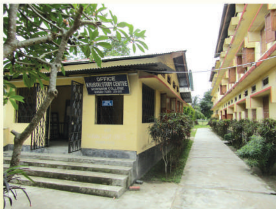
KKHSOU Study Centre