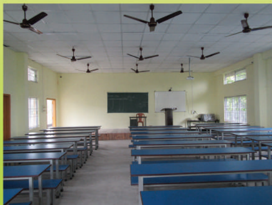
A Newly constructed classroom cum seminar hall