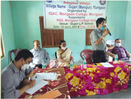
Adopted Village, Oujari (Manipur) Extension Activity Organised by IQAC, Morigaon College