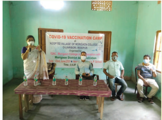
Covid-19 Vaccination Camp Extension Activity Organised by IQAC, Morigaon College