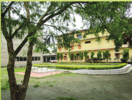
A view of the Campus