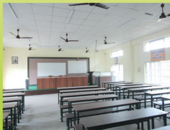
Hall - 1