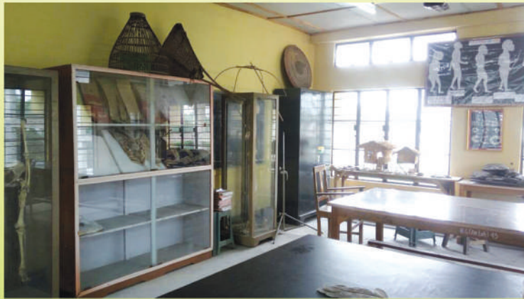
Museum, Dept. of Anthropology