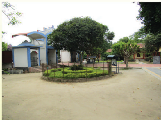
A view of the College