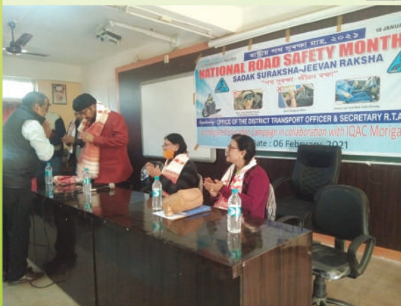
National Road Safety Month Extension Activity Collaborated by IQAC, Morigaon College